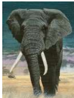
Item FL-09, SL-08